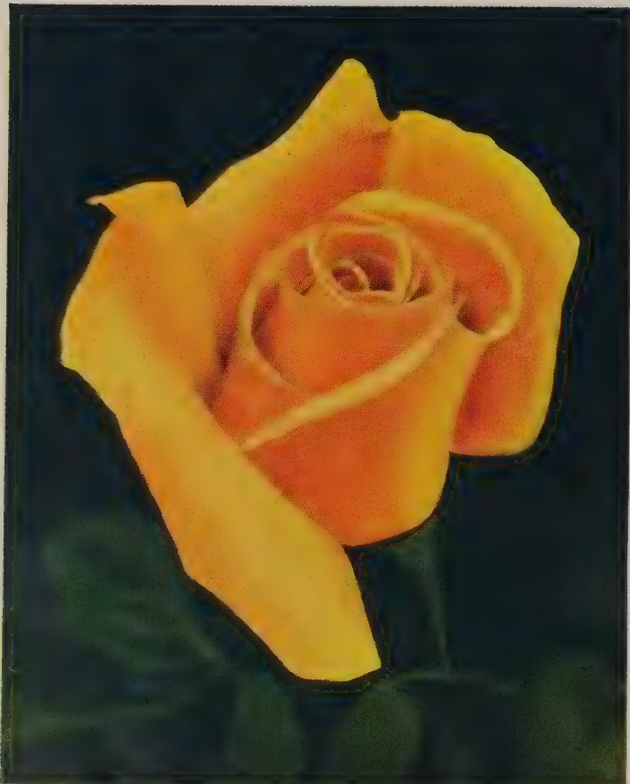
MME. JOSEPH PERRAUD

DUQUESA DE PENARANDA —A beautiful rose with a coloring of orange-apricot backed with deeper coppery tones. A strong upright grower with plenty of clean bright foliage.